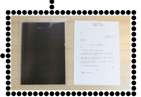
Ready your document