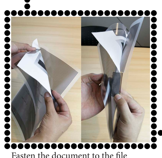
Fasten the document to the file