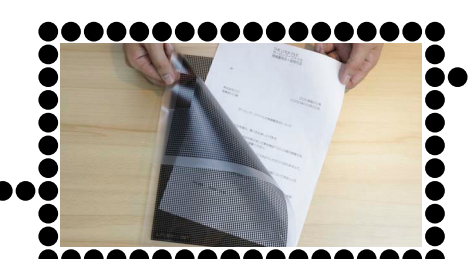
Insert selected file into THE LOCK FILE